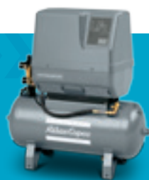
LFX Tank Mounted